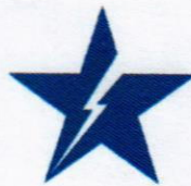
EXHIBIT tabbles 1